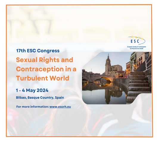
Facebook post 1080x1080