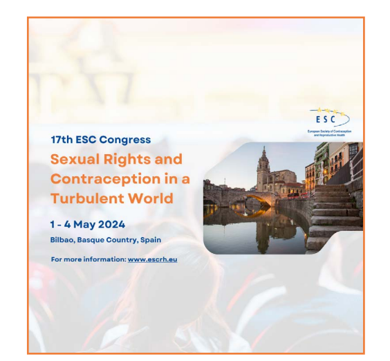
Instagram post 1080x1080