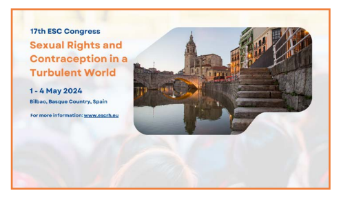
Facebook Cover 1640x924